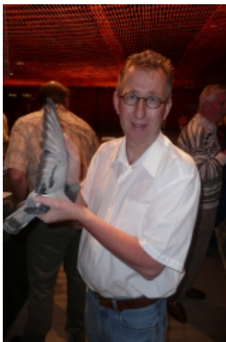
Good Aim, the successor of JD Action