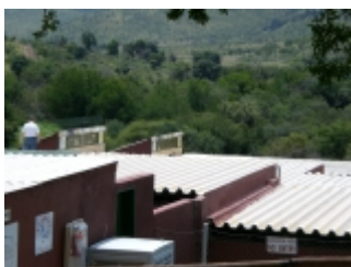
The lofts of SCMDPR