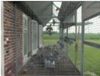
Youngsters in the loft, 2009

You can read more about young bird racing in my column.