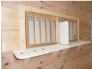
Opening in the wall