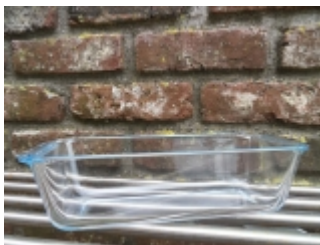
Glass drinking trays